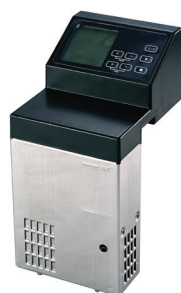
SV-120 MADE IN CHINA