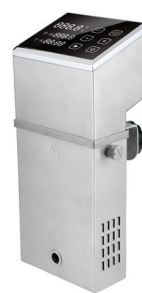
SV-310 MADE IN CHINA