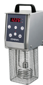
SOFTCOOKER 230 MADE IN ITALY