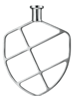
WSM7LMP Stainless Steel Mixing Paddle