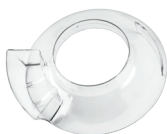
WSM7LSG Splash Guard/ Feed Chute