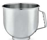
WSM7LBL 7-Quart Stainless Steel Bowl