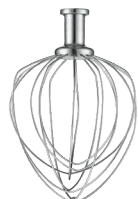
WSM7LW Stainless Steel Chef's Whisk