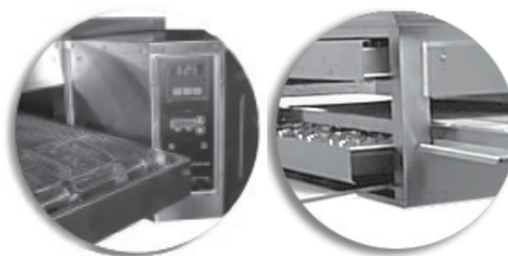
Removable panels for easy cleaning