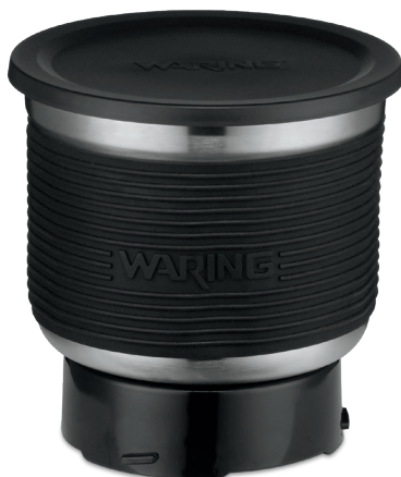
CAC128 Stainless Steel Bowl with Lid