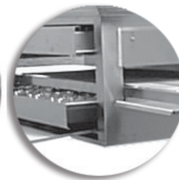
Removable panels for easy cleaning