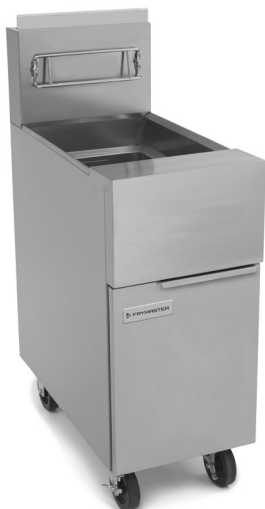
GF40 Shown with casters