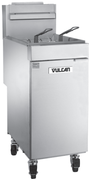
Model 1VEG35M Shown with caster accessories